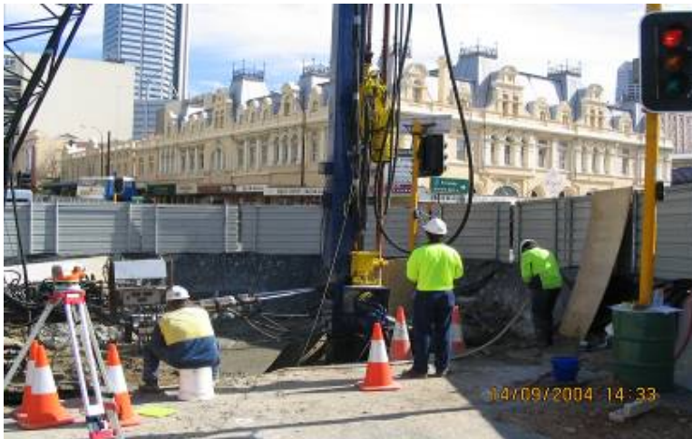
Jet Grouting Operation