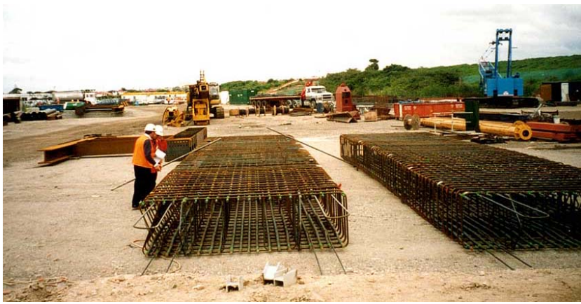
▲ Steel reinforcement cages for diaphragm wall construction