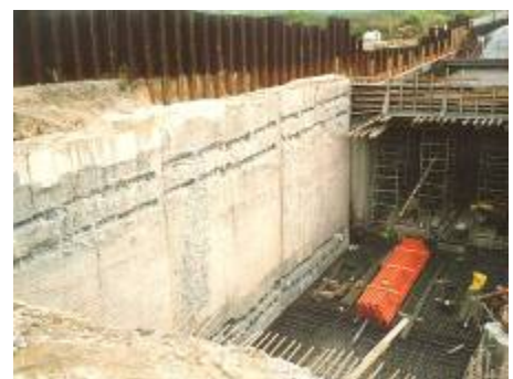
▲ Exposed diaphragm wall section prior to roof slab construction

The M5 East Motorway was opened on 9 December 2001 approximately 6 months ahead of schedule.