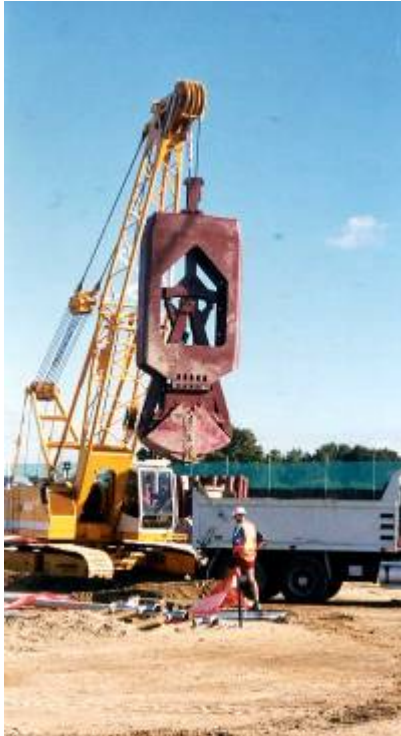
▲ Clamshell on excavation crane