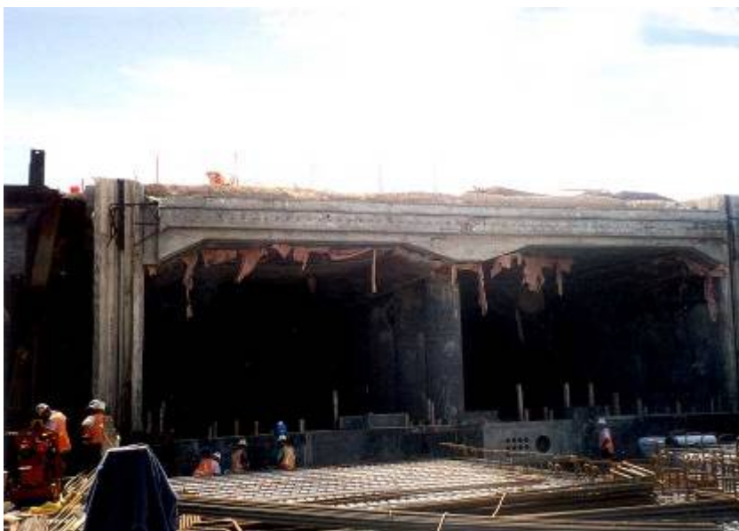
▲ Entrance to tunnel at approach ramp

OWNER : Roads and Traffic Authority (NSW)