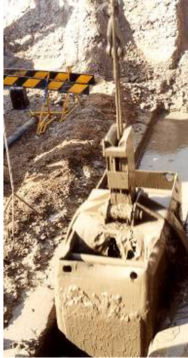
▲ Diaphragm wall excavation under bentonite