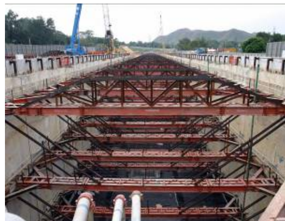
Kwu Tong station box